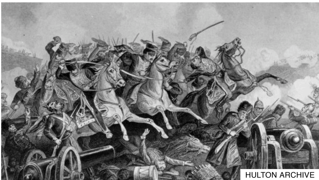
The charge of the Light Brigade at the battle of Balaclava during the Crimean War